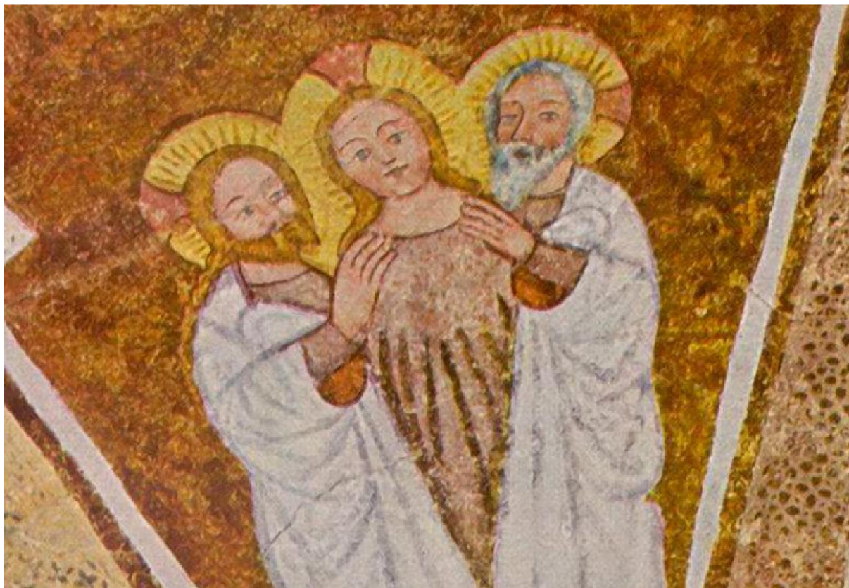
„Dreifaltkeitsfresko“ St. Jakobus-Kirche Urschalling im Chiemgau

https://de.wikipedia.org/wiki/Dreifaltigkeitsfresko_Urschalling